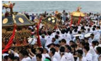
Excitement runs high at Wakasa region's largest summer festival, the Wakasa Shichinen Matsuri festival . It is only held once every seven years, and attracts plenty of visitors from out of town.