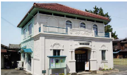
The former Kyoto Dento Takahama Sales Office, designated as a national registered tangible cultural property