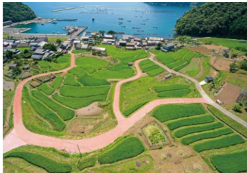
The Hibiki Rice Terraces, chosen as one of Japan's top 100 terraced rice fields