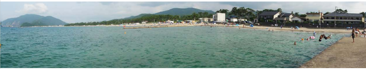
With its shallow clear blue waters, Torihama is a beach-lover's beach, and especially popular with surfers.