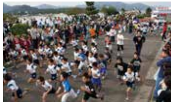
The Wakasa Takahama Hamanasu Marathon is held every fall. Children and adults alike take in the beach views as they run energetically around the coastline.