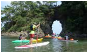
Visitors can see the sights of Takahama on the " Dokoiko! Nanishiyo! " mini-tours , conducted by townspeople in a show of local hospitality.