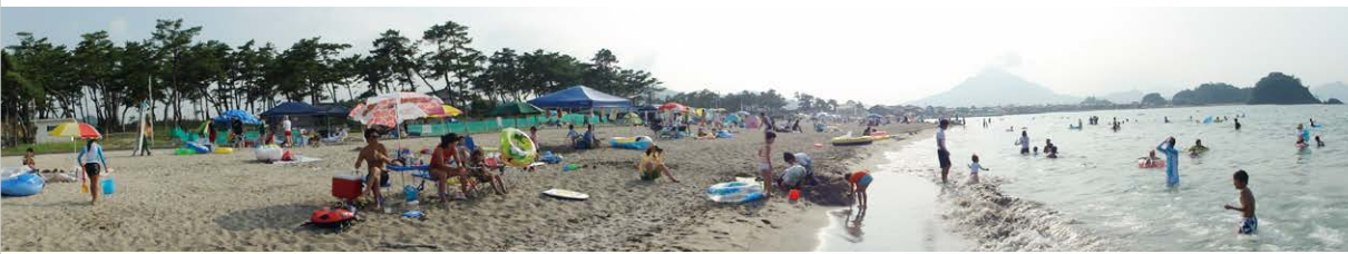
You don't need shoes on the pure white sands of Shirahama, the perfect beach to enjoy barefoot.