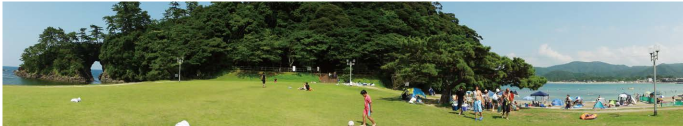
The blue sea extending beyond the green of Shiroyama Park , where you can enjoy seasonal activities like cherry blossom-viewing in spring,swimming in summer, and picnics in the fall.

Take in the sea views from the ruins of Takahama Castle and Shiroyama Park. Look out over a strange gaping hole in the cliffs. The horizon behind it is singularly charming, like a glossy mirror image.