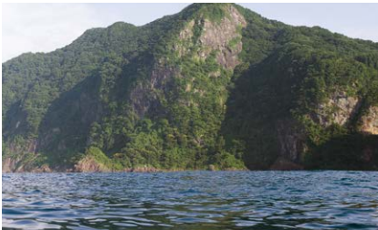
The raging waters of the Sea of Japan crash against the spectacular Otomi Daidangai cliffs