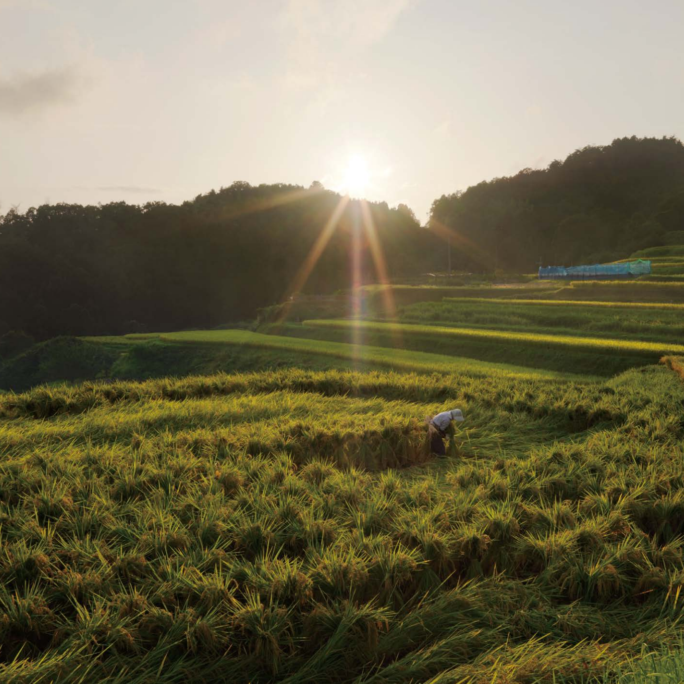
Rice harvesting at dusk: a scene that deserves to be preserved