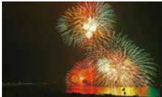
The town's impressive annual fireworks display takes place on August 1. Your body will thrill to the bang and crash of all kinds of fireworks including over-water displays.