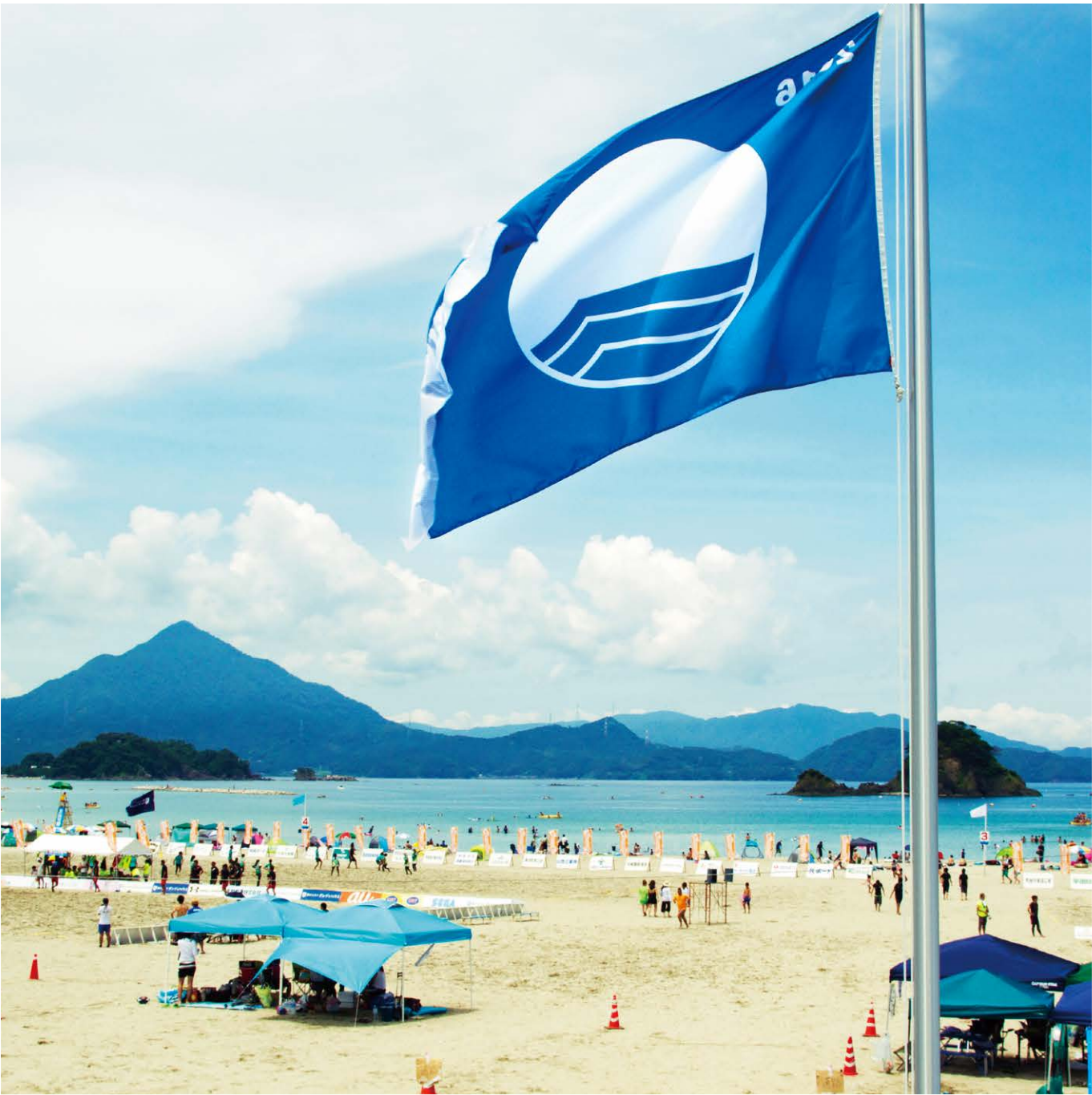
Summer in Takahama: the shallow waters and expansive sandy beach of a town renowned and loved by many as a resort since olden times