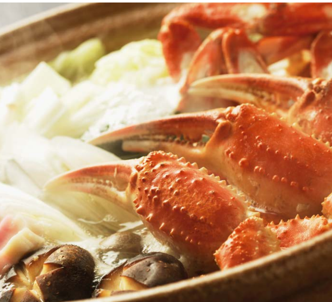
Piping-hot nabe hotpot full of plump crab is just the thing for a cold winter