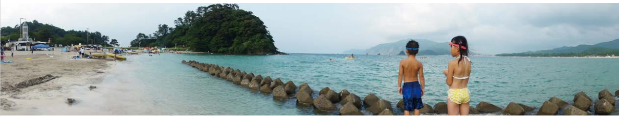
The gentle waves of the mellow beach of Shiroyama make it a relaxing place to spend time until the sun goes down.