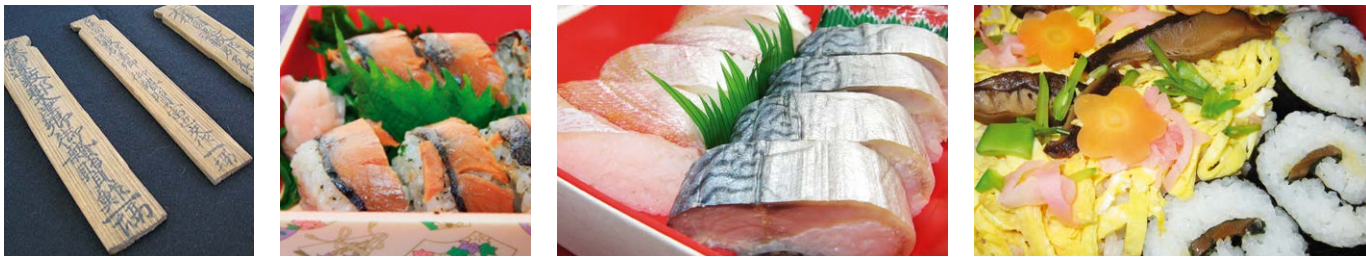
The discovery of 1300-year-old wooden writing tablets suggests sushi has long been associated with Takahama. The rich variety of sushi from Wakasa-Takahama: (from left) pickled flame-grilled mackerel, pressed oshizushi, traditional chirashi-zushi