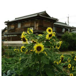
Life is cozy and unchanged in the narrow backstreets of Wada

When you enter the narrow streets with their old houses standing shoulder-to-shoulder, you feel like you're lost in a nostalgic era. Coming out of the backstreets and seeing the ocean beyond coming into view is a thrilling moment.