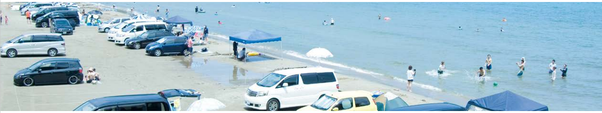
The lively town beach of Nabae is perfect for water sports, as cars can drive right onto the beach.