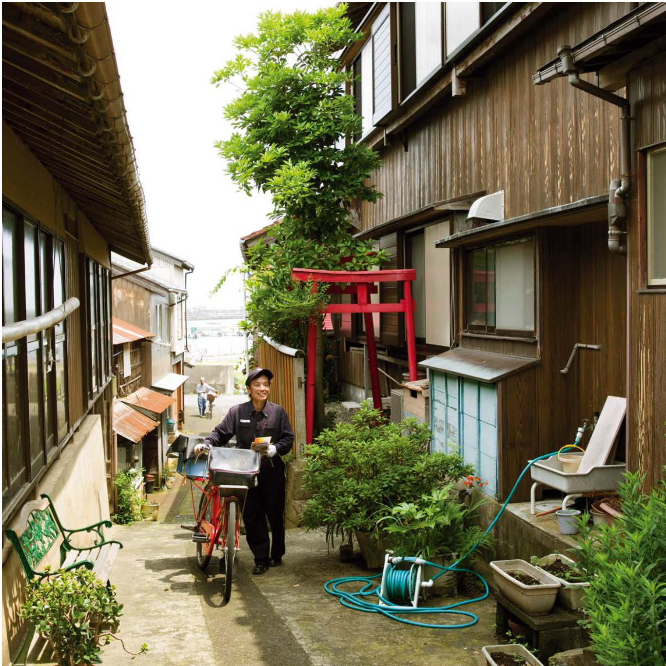
Discoveries and encounters at every corner in the backstreets of Inari