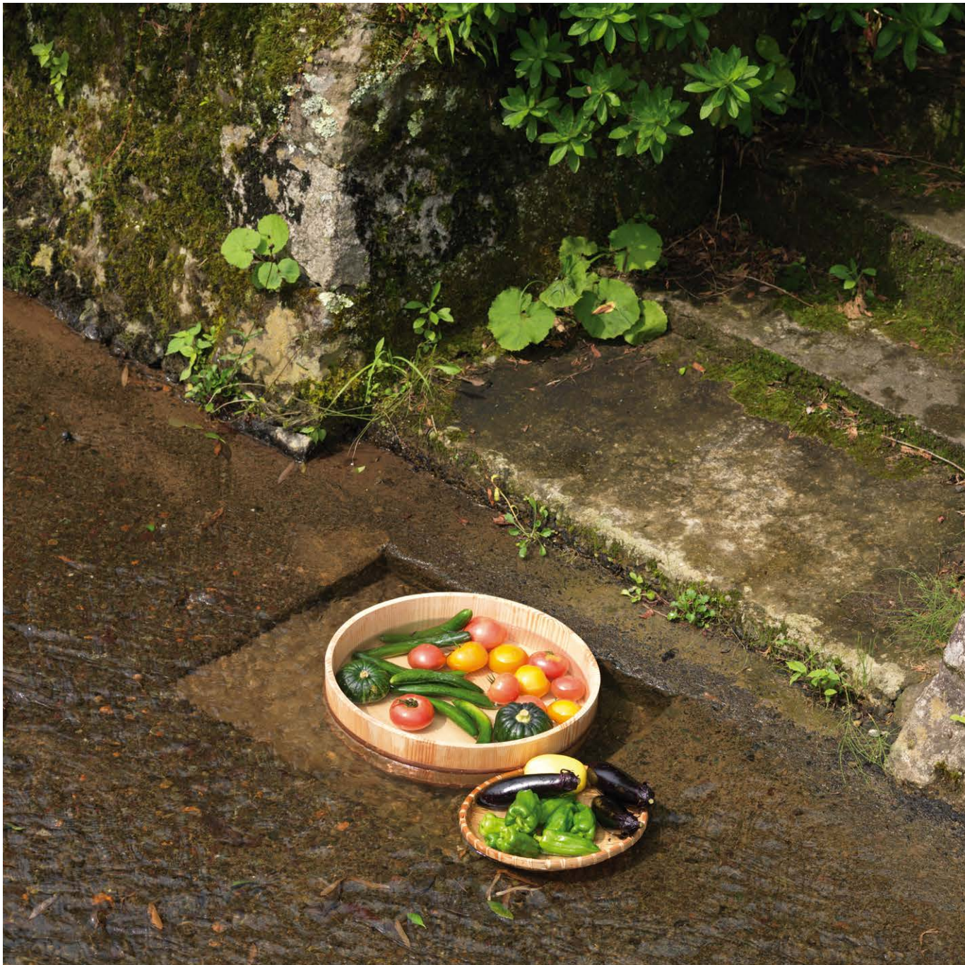
Mouth-watering summer vegetables grown on Mt. Aoba and chilled in river water