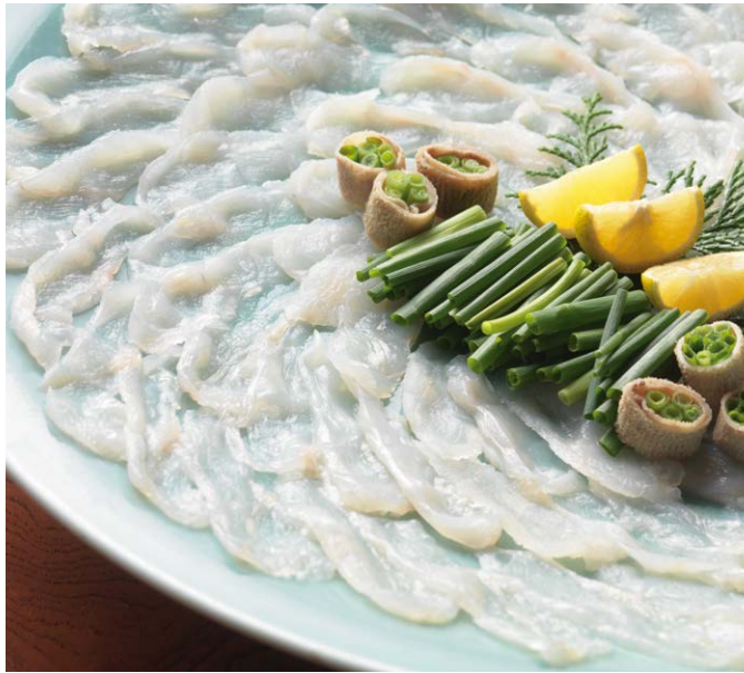
Wakasa fugu: firm-fleshed fugu, fresh from the Sea of Japan

Wakasa's famous fugu (blowfish), crab and seasonal fish. Sushi is said to originate here. Wherever you eat, portions are on the generous side: the townspeople don't talk much, but go out of their way to extend hospitality.