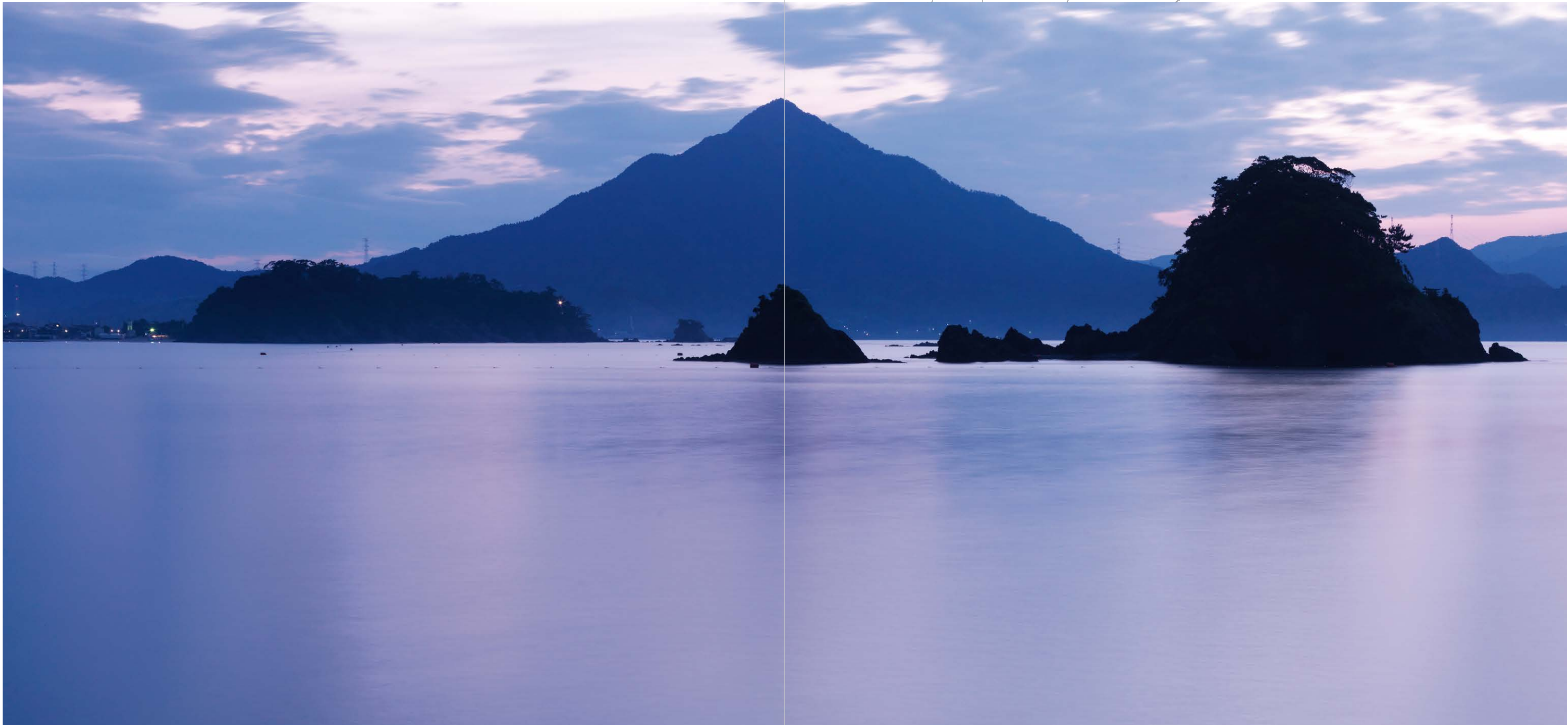
View of Mt. Aoba from the beach