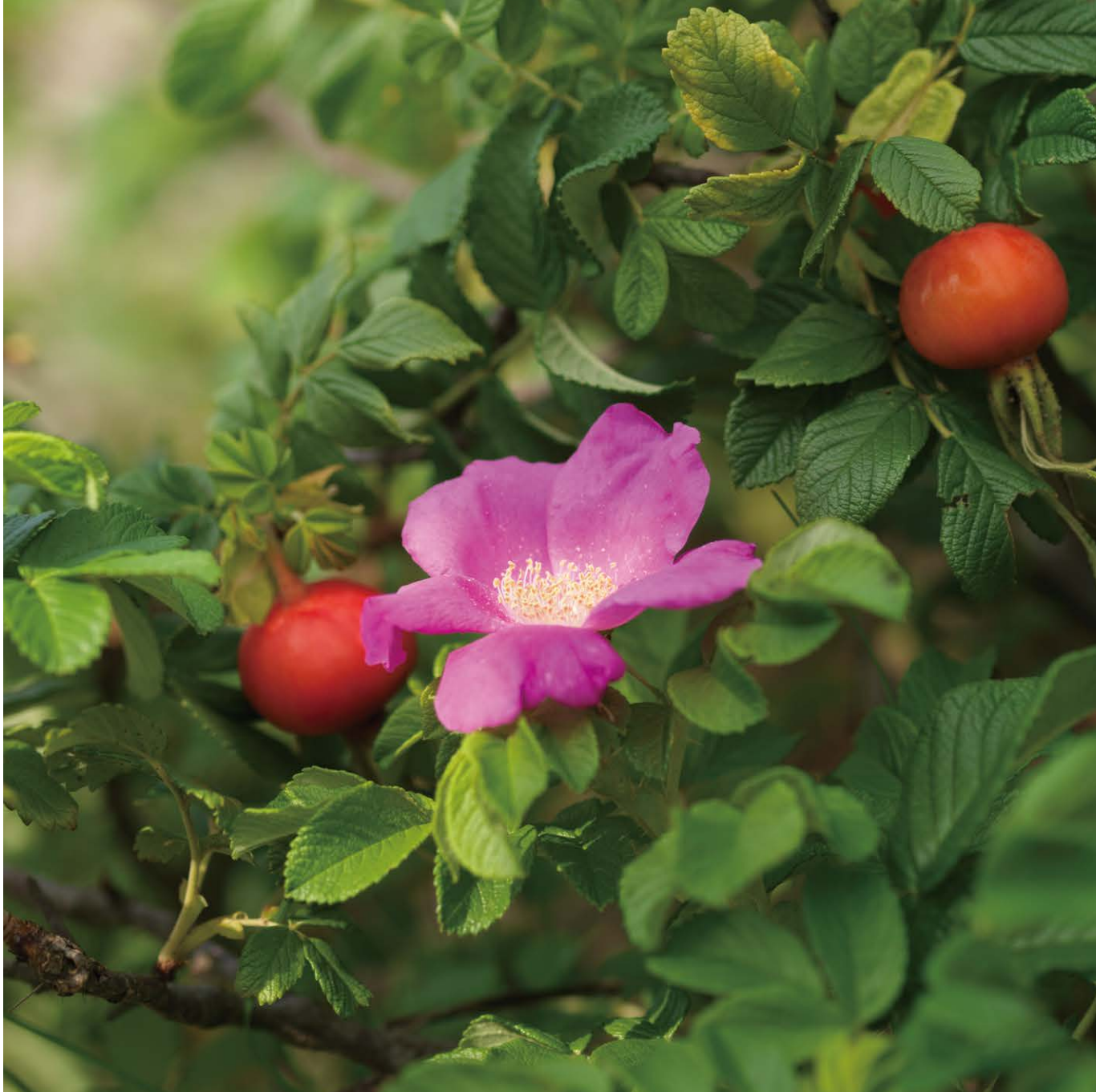
The blooms and fruit of the Japanese beach rose, flower of Takahama