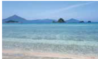
The people of Takahama want to look after the natural world they live in. The town's beaches were the first in Japan to get international Blue Flag status.