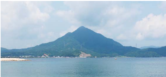
Mt. Aoba, affectionately known as Aoba-san by the locals