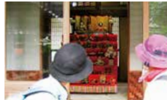
With the annual arrival of spring, local businesses and homes along " Hinamatsuri (Doll Festival) Road " display their Hina dolls, including some that date back to the Edo period.