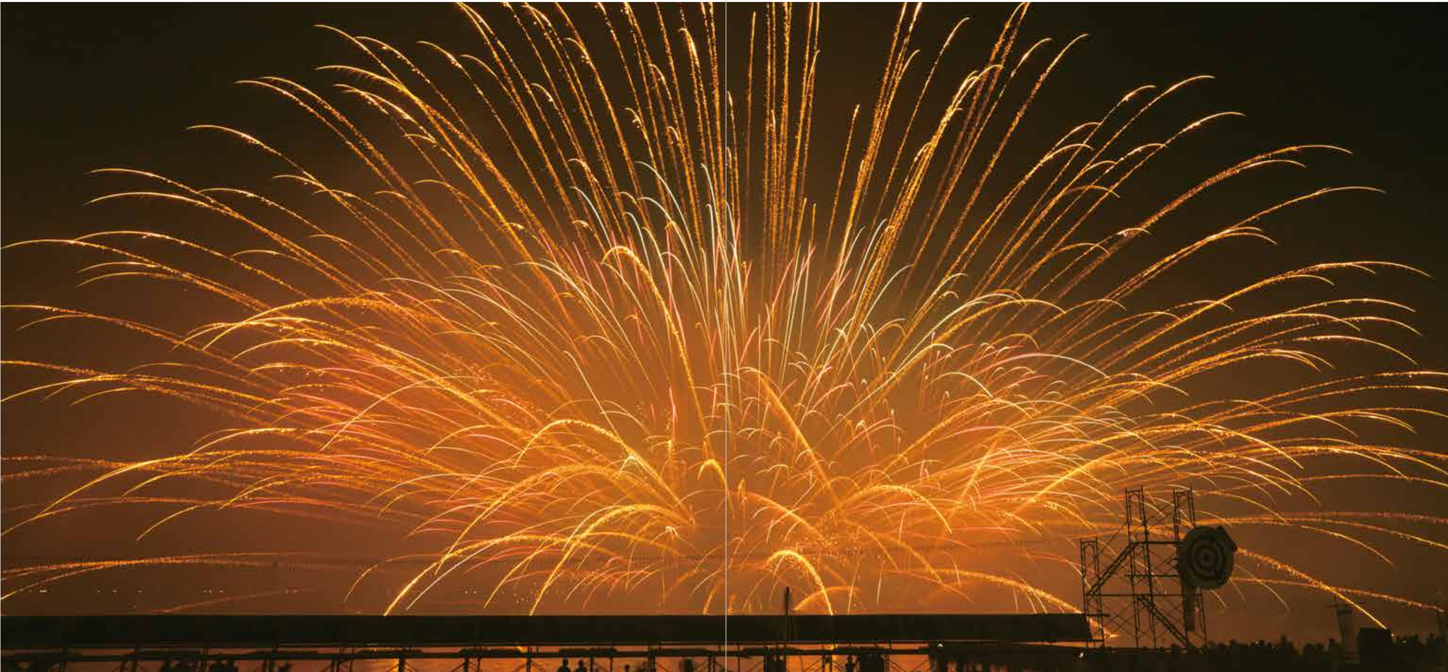
Fireworks over the water add a rainbow dazzle to memories of summer