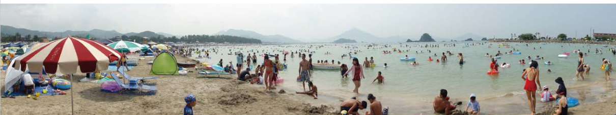
Wakasa Wada Beach, always full of smiles, is the area's most popular beach, and garnered Blue Flag status in April 2016.