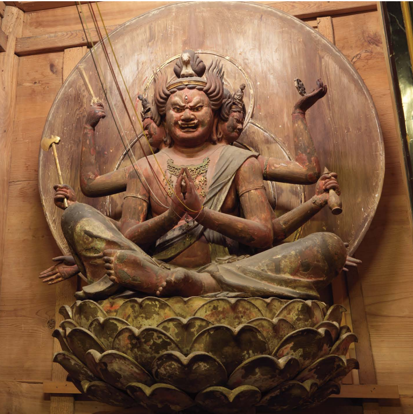
Nakayamadera temple's statue of the horse-head-wearing Kannon Bosatsu , a nationally-designated Important Cultural Property only put on display once every 33 years