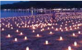
Countless carefully-made candles look lovely lit everywhere from the beach right into town, as part of the magical Isaribiso festival.

The people of Takahama love festivals so much so that when summer comes around, there always seems to be a festival happening somewhere. The normally sedate town goes wild on festival days, which range from the excitement of creative firework displays to eco-friendly fun in nature.