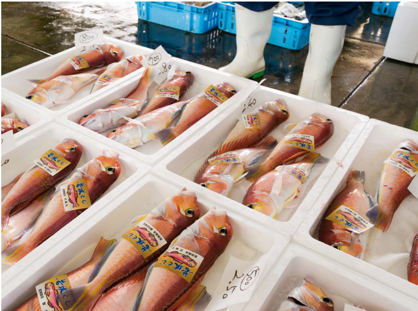
The fish market is full of fish found only in Wakasa Bay. Auction of Wakasa-guji (red tilefish)