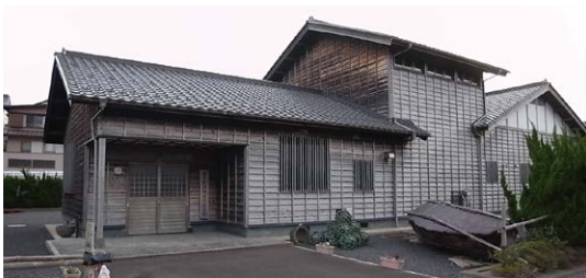
The museum of fishing village culture and tradition conveys the history of the local fishing industry