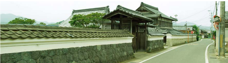
Vestiges of the town's trading past remain in the traditional townhouses, storehouses and tiled roofs of the old Tango Highway