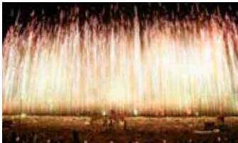
The creative fireworks display started by young local festival lovers and called Yagura Dragon gets Isaribiso going with wild light and sound.