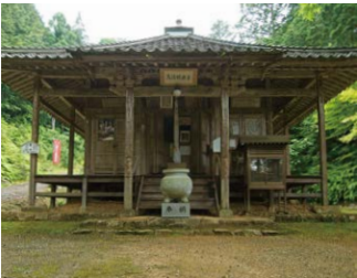
Magoji temple ,said to be founded by Prince Shotoku