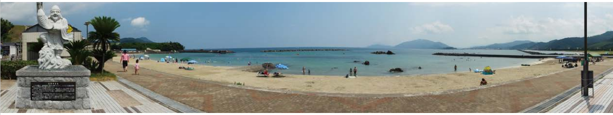
Ebisuhama Park is a laid-back beach for more mature tastes, where you might read a book and enjoy the peace and quiet.