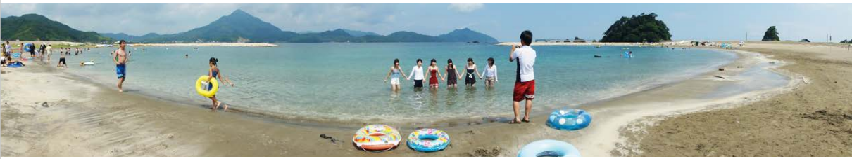
Wakamiya is a family beach with a nearby fishing pier where parents and children can have fun together.