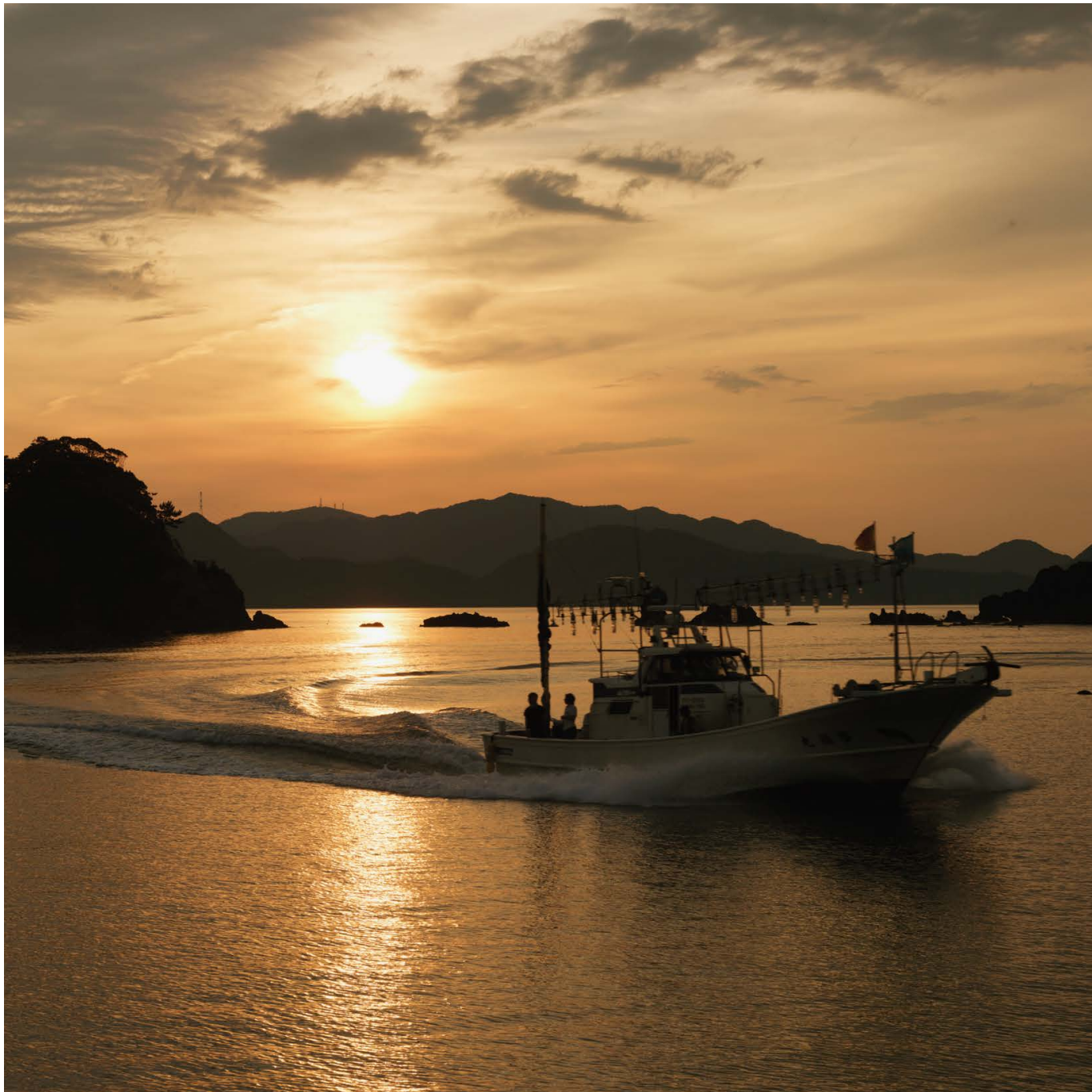
A beautiful sunset paints a calm sea and fishing boat