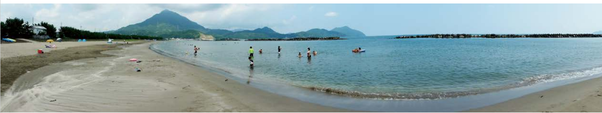
Hamanasu Park is a panoramic beach with a commanding view of Mt. Aoba from the foreshore.