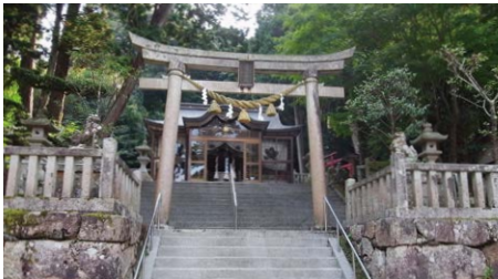
The Sakichi-jinja shrine , known as the focus of the Shichinen Matsuri festival