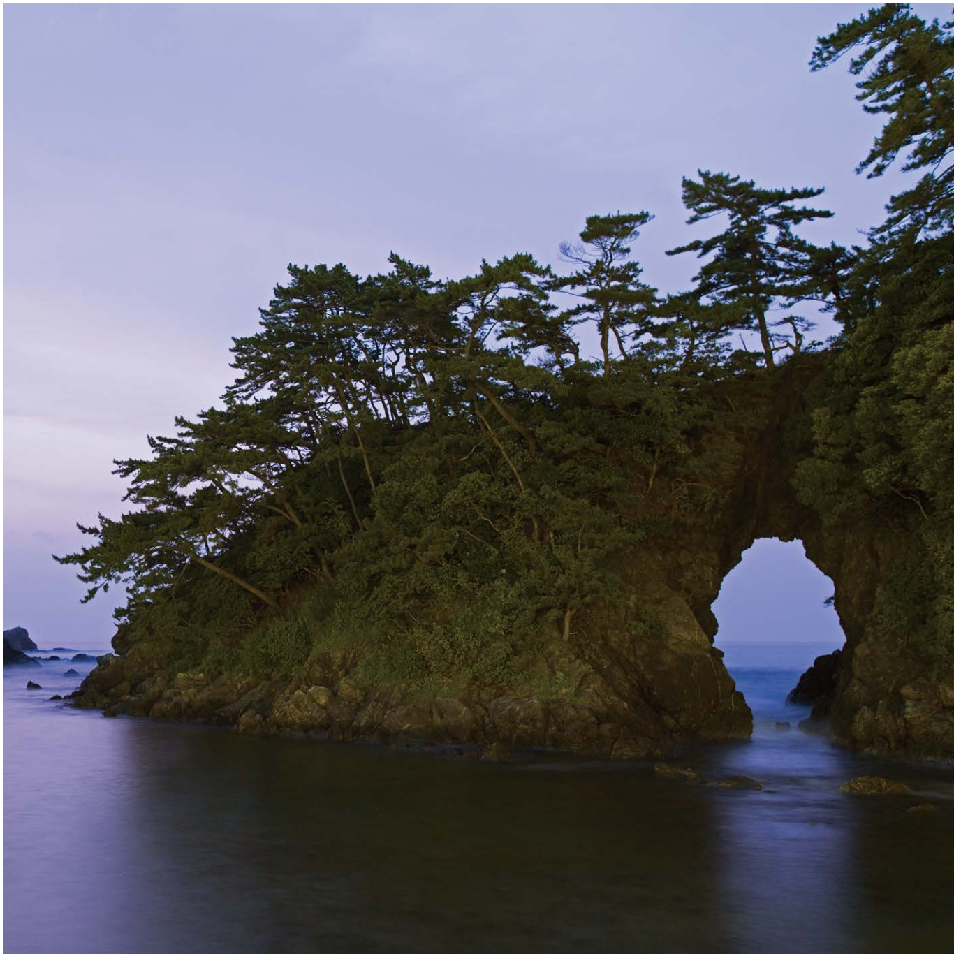
A magical sunset behind Meikyodo Cave