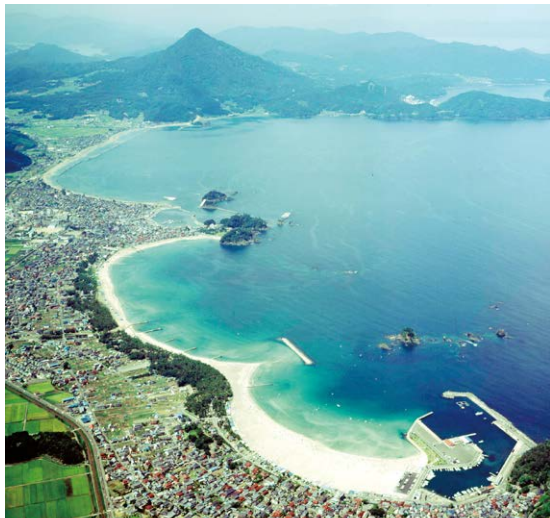
Panoramic view of Takahama: a veritable microcosm of Japan with its combination of sea and mountain

Terraced fields of swaying rice plants. The pink of Japanese beach rose against the green. Mt. Aoba, at the heart of Takahama. Walk the mountain trails, close your eyes, take a deep breath. You're sure to feel an invisible power here.