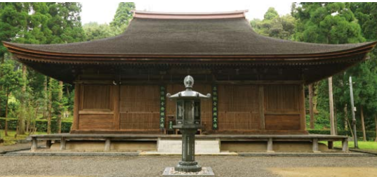
The grandeur and history of Nakayama-dera temple's main hall , a nationally-designated natural Important Cultural Property.

Takahama is dotted with important cultural assets. Japan's celebrated historical heritage is found in Takahama's quiet and secluded temples. Enjoy the peace.